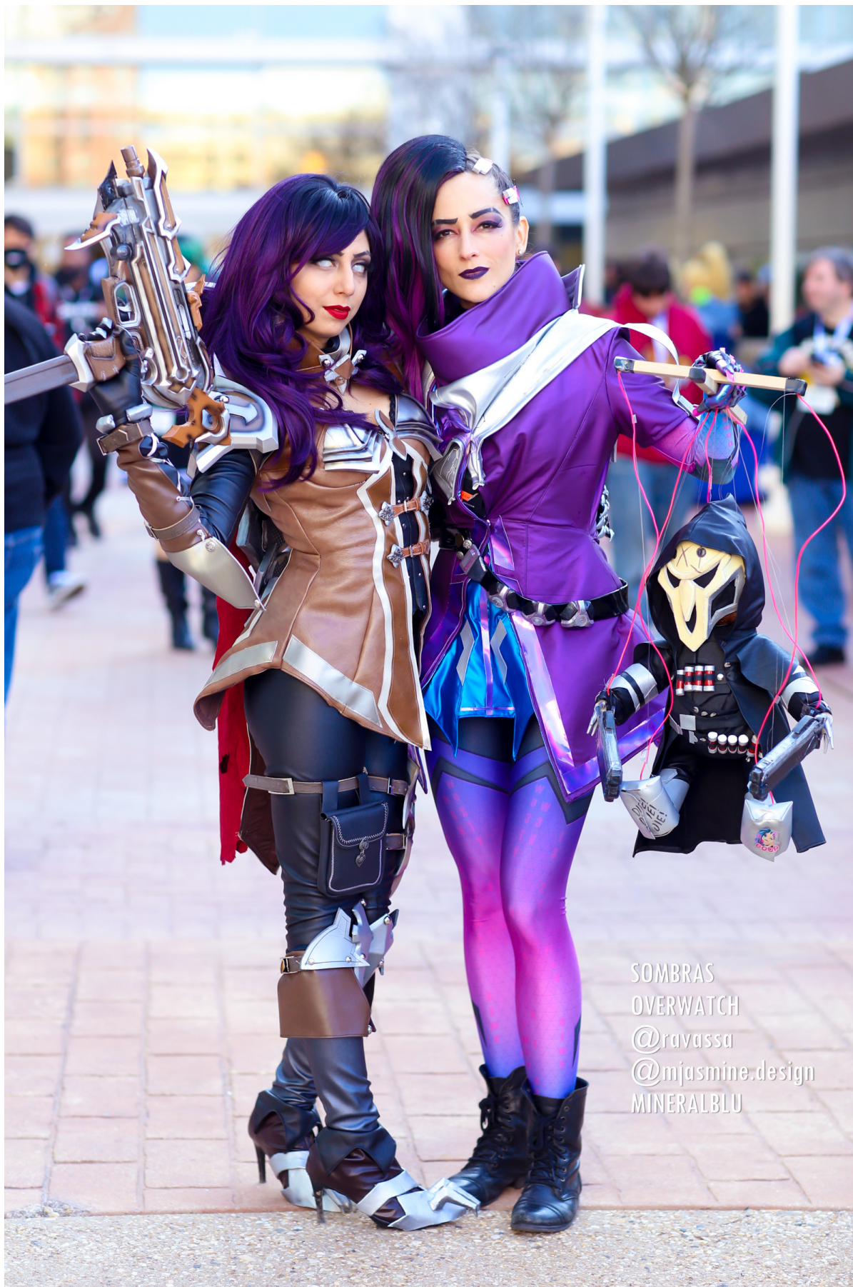
SOMBRAS OVERWATCH @ravassa @mjasmine.design MINERALBLU